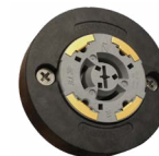
NEMA P7 Receptacle