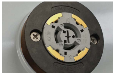
NEMA 7-pin rotatable photocontrol receptacle