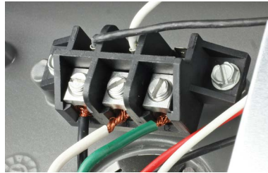
Terminal block can be wired using only a flat blade screwdriver