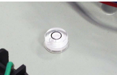
Internal bubble level facilitates installation