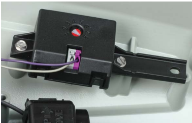
Field-adjustable output (FAO) module