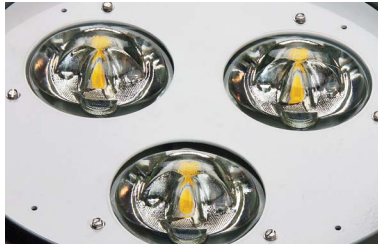
High efficacy LED engines with durable prismatic glass optics