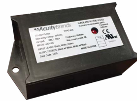
20kV/10kA "extreme" surge protection device with functional indicator light