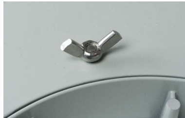
Stainless steel thumb-screw for tool-less access