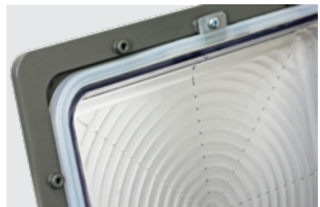
Silicone gasket on the removable door to the IP65 rated optical compartment keeps moisture and dirt from entering.