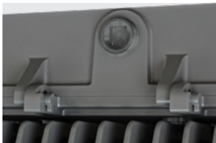
Dual stainless steel latches with tamper-proof option provide access to electrical housing.