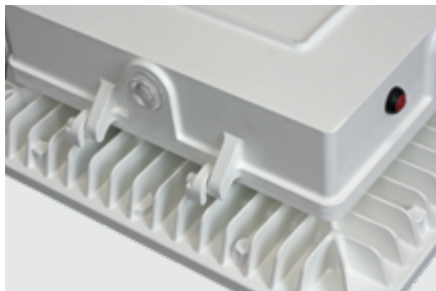
Robust 3G-rated cast aluminum construction provides exceptional durability and thermal management.