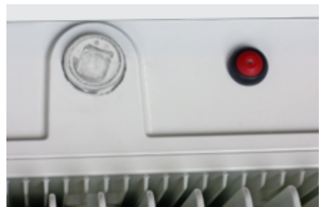
Optional emergency backup driver with external test button.