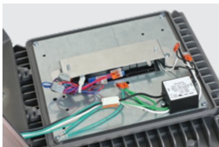
IP66 rated electrical contains high performance driver and the Acuity Brands 20kV/10kA extreme surge protection device.