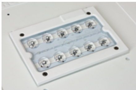
IP66 rated LED engine provides efficiency and uniformity through high LPW and precision Holophane optics.