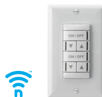
rPODB 2P DX