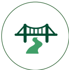
Bridges, Intersections & Tunnels

Lighting and controls solutions tailored to your facility, combined with the information you need to complete your project. Get spec sheets, BIM and IES files, utility rebate calculations and more.